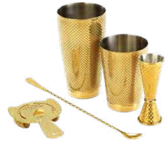
Gold Plated M37206GD