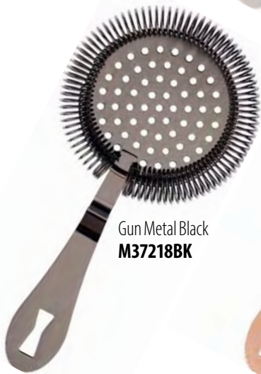
Gun Metal Black M37218BK