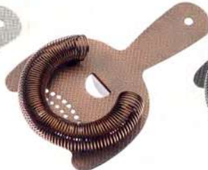
Antique Copper M37203ACP