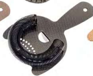
Gun Metal Black M37203BK