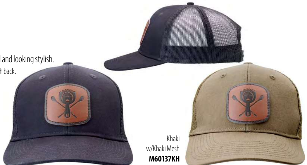
Black w/Black Mesh M60137BK