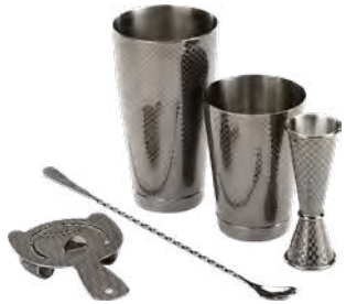
Gun Metal Black M37206BK