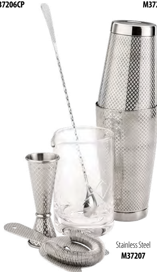
Stainless Steel M37207