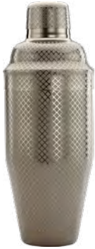
Gun Metal Black M37205BK