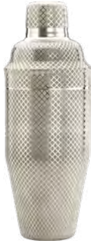
Stainless Steel M37205