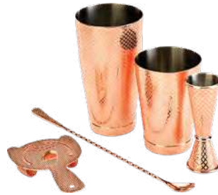
Copper Plated M37206CP