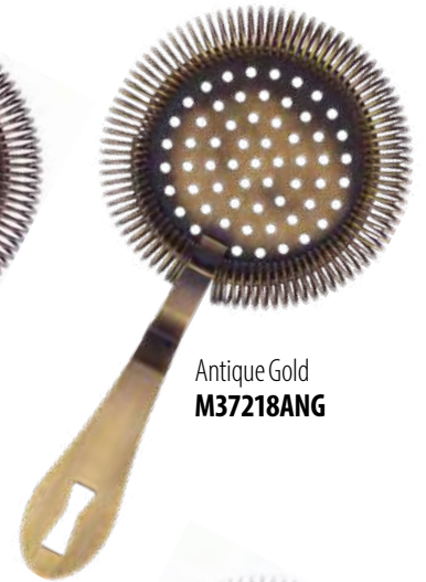
Antique Gold M37218ANG