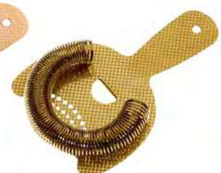
Gold Plated M37203GD