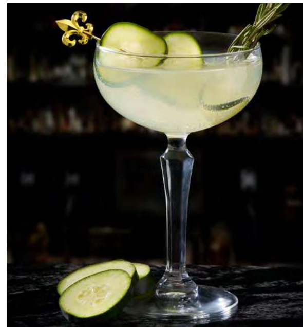
Gold Plated M37208GD