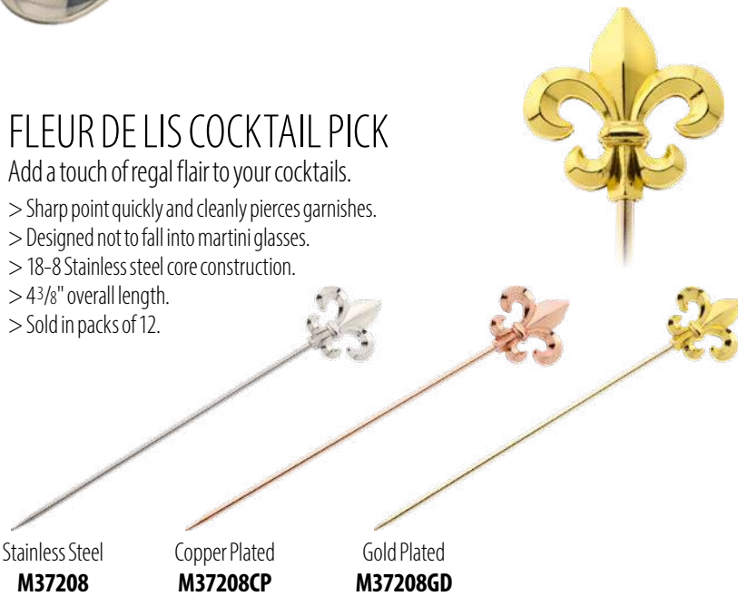
Stainless Steel M37208