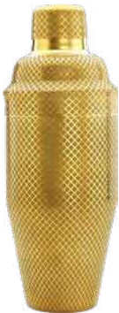
Gold Plated M37205GD