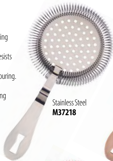
Stainless Steel M37218