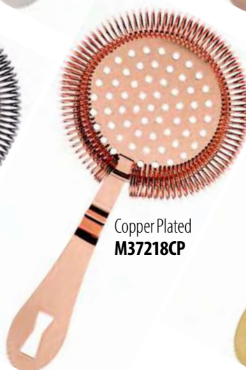
Copper Plated M37218CP