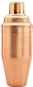
Copper Plated M37205CP