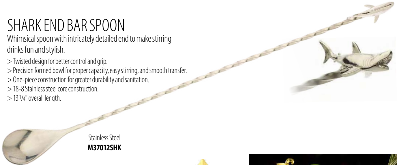
Stainless Steel M37012SHK