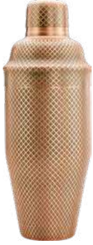
Antique Copper M37205ACP