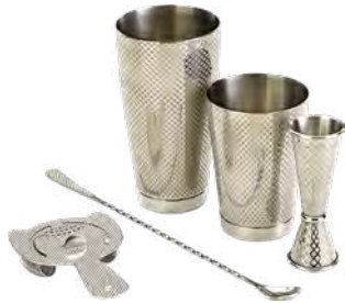
Stainless Steel M37206