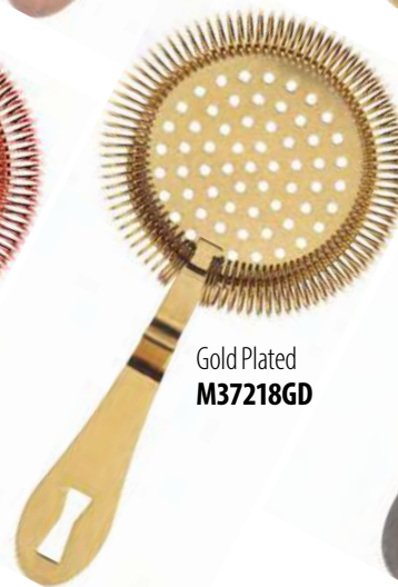
Gold Plated M37218GD