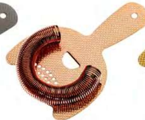
Copper Plated M37203CP