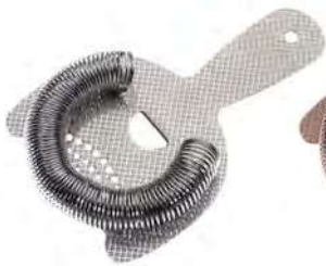
Stainless Steel M37203