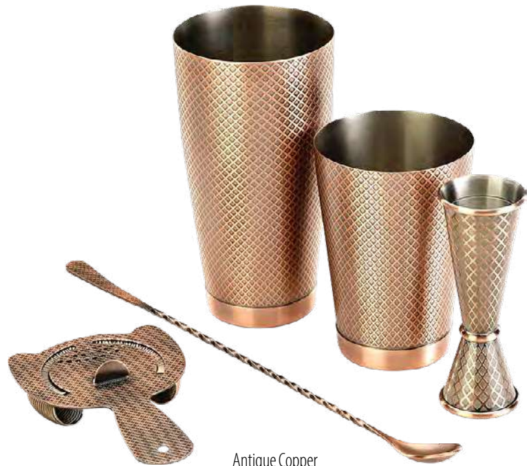
Antique Copper M37206ACP