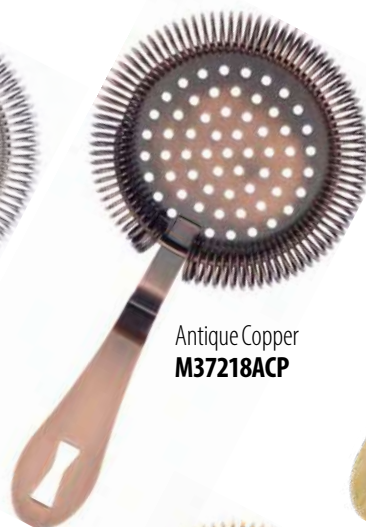
Antique Copper M37218ACP