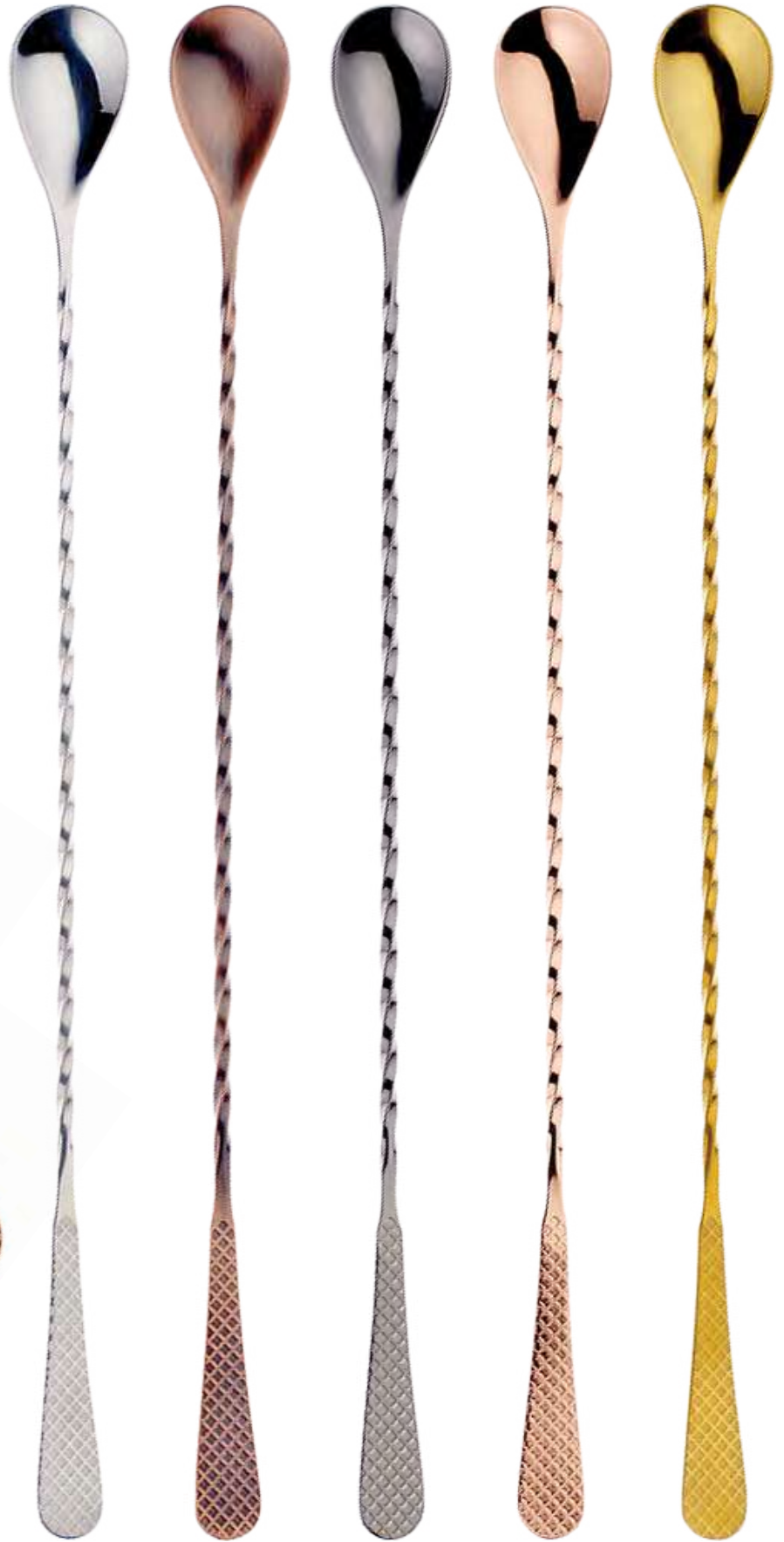
Stainless Steel M37204